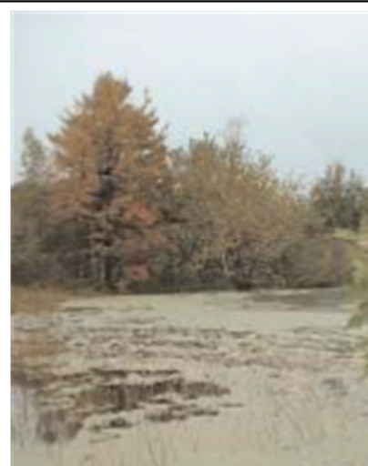
High phosphorus levels in lakes cause dense algae blooms, which can accumulate along the shoreline as shown above.